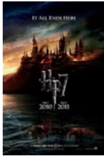
Harry Potter Deathly Hallows 2