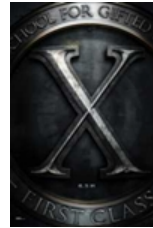
X-men: First Class