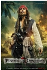
Pirates of the Caribbean 4